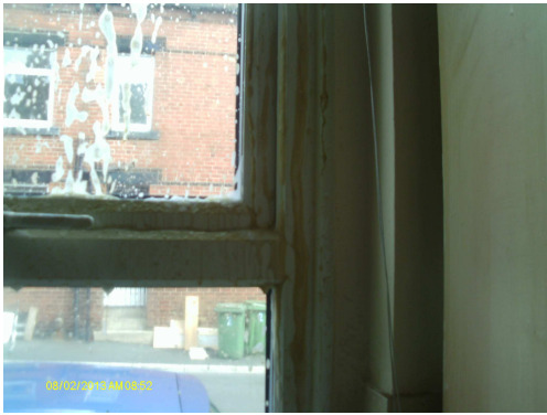
Kitchen window before cleaning.