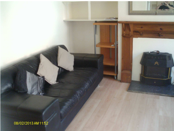
Lounge after cleaning