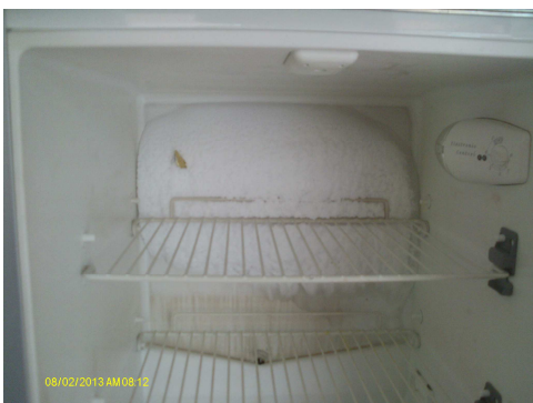
Fridge before cleaning.