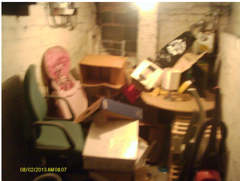
Cellar before cleaning.