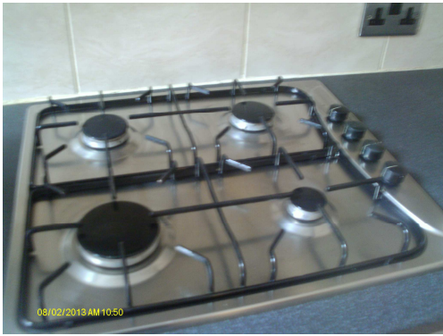
Hob after clean