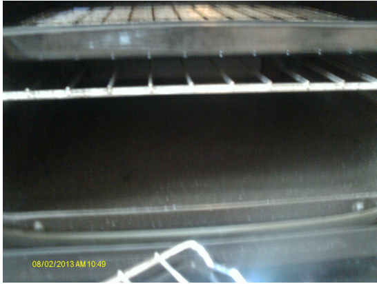
Oven after cleaning.