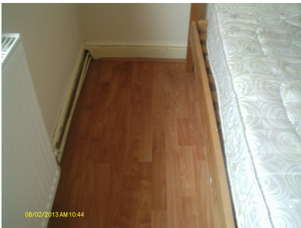
Main Bedroom floor after Cleaning