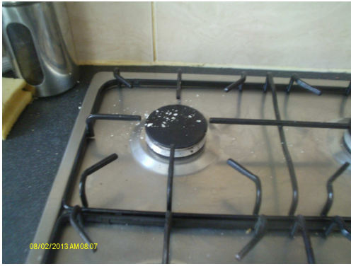
Hob on arrival