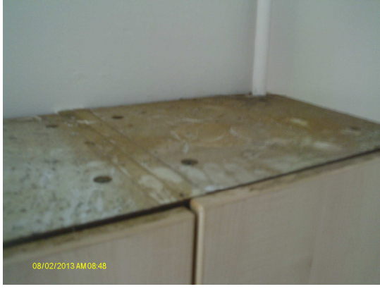
Top of wall units before clean.