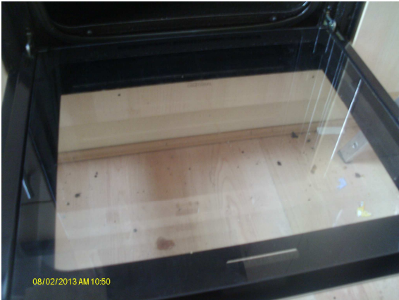
Oven after cleaning.