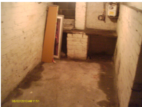
Cellar after cleaning.