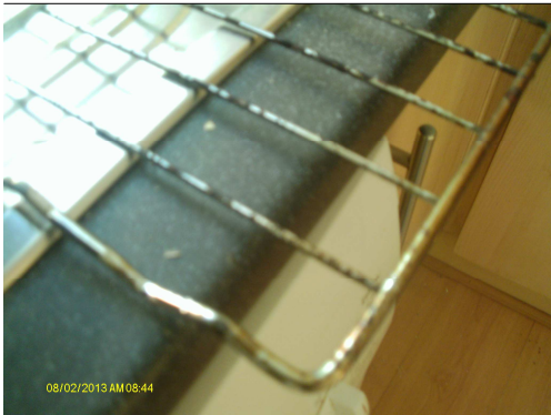
Shelves before clean