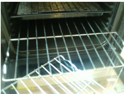
Shelves after clean