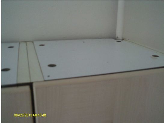
Tops of wall units after clean