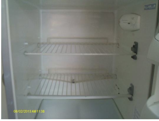
Frdige after cleaning.